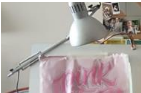
Figure 3: Bed used as a storage space

Students prefer quick and easy repair and develop their ways to fix products like in the example of attaching a table lamp to different surfaces and putting an extra layer between the mattress of the bed and base. However, they do not change the cover of the couch by themselves because it requires specific skills. We conclude that difficulty, laziness, lack of motivation and time are the reasons for limited repair and appropriation of products in the student houses. As in the Van den Berg and Bakker's (2015) circular design guideline, disassembly and maintenance are significant for designing products for student houses; the components need to be removed, cleaned and changed for easy repair and longer usage time. Therefore, if products are open to user intervention and designed for easy repair, the exchanged products in student houses can have longer usage time and students can be encouraged to repair and appropriate them.