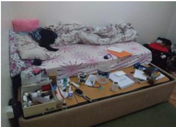
Figure 2: Broken lamp

Students want to receive products for their basic needs. They agreed to receive products from the freecycle even if that product has some problems and is damaged. They prefer to use defective products with minor repairs instead of discarding them. As an example, P3 keeps using the bed taken freecycle even though it threatens his health and he consoles himself compared with sleeping on the floor. He emphasizes that his basic need is to have something to sleep on. Similarly, P9 has a lamp that can not stand by itself because of the broken structure. She tried to find a temporary solution such as attaching a lamp to some surfaces like a corner of the table or stacking between bookshelves and heater (Figure 2). Moreover, students appropriate second-hand products and change the usage context according to their preferences, as in the example of using an extra-base of the bed as a storage space for personal belongings (Figure 3).