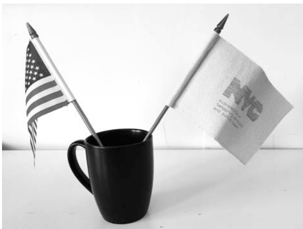
Figure 2: STOPD's logo.