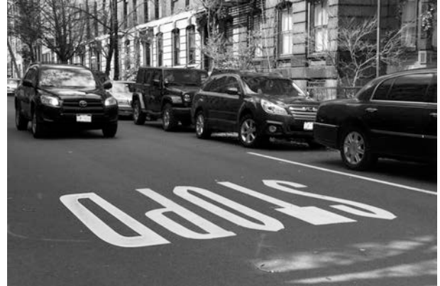
Figure 3: Public manifestation of STOPD's signature.

They only meet in the hallways, as a means to get things done quickly and avoid getting trapped by the mazes of bureaucracy. When they need to make inter-agency contact, they use the elevator. They meticulously wait for specific people to enter, and jump in with them, quickly finding an opportunity to pitch ideas.