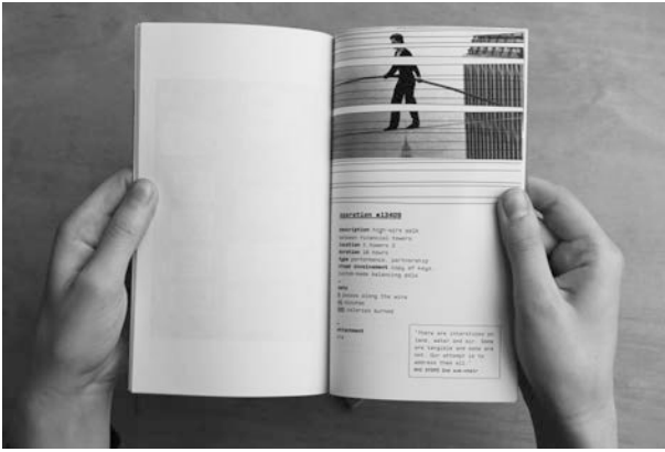
Figure 5: Documentation of an experiment in STOPD's report of operations.