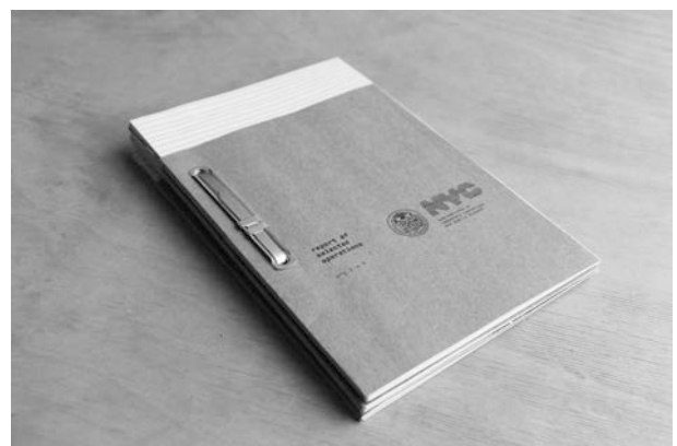
Figure 4: STOPD's report of operations.

While their experiments are temporary, the possibilities they open are permanent. Therefore, the curatorial wing of the group is in charge of storing ideas of infiltration-opening in decentralized yet connected archives throughout the city. Nowadays, they have mainly transitioned to digital technologies of storage, and are placing georeferenced USB sticks on small holes of street walls. They also encourage the population to do it by distributing kits with the device and a small portion of cement.