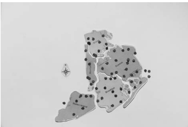
Figure 6: Outreach of Interstices.

To a lesser extent, STOPD has been cited in academic papers and scholar lectures.