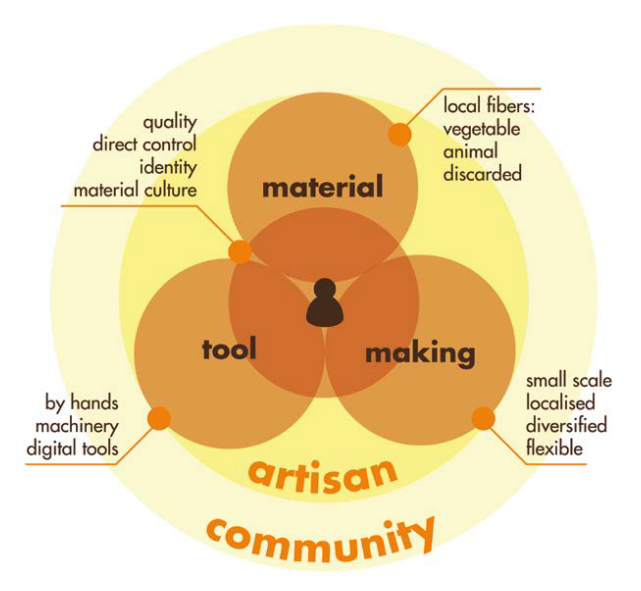
Figure 1: Human-centred framework of artisanship.

communities are bottom-up aggregations rooted in a territory, sharing material cultural background, and coevolving in line with artisans' needs (Bettiol and Micelli 2014). By using local resources and aesthetic references, textile artisans' communities portray in their fabrics and garments socio-cultural traditions, representative of a particular region and passed down from generation to generation.