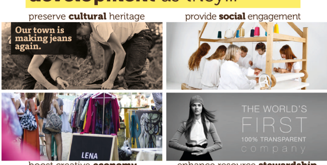
Figure 2: Holistic contribution of textile artisans' communities to sustainable development.

The designer plays an important role to facilitate sustainable development. He/she is called to understand communities' creative ways of organizing, triggering social interactions and co-designing strategies for innovation (Meroni 2007). While many textile projects focus on reducing the environmental impact of manufacturing, designers' decisions at the outsets can