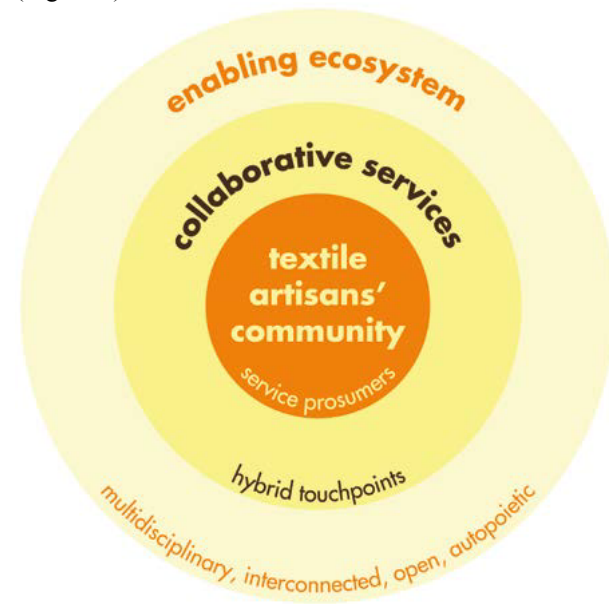
Figure 4: Contribution of service design to textile artisans' communities

paradigm of competition in favour of peer-to-peer relationships, inspired by co-sustainment within natural systems (i.e. biomimicry), which co-evolve without affecting each other. The proposed service design model is expected to give birth to new forms of active communities, triggering new ideas of locality and a stronger sense of belonging and social responsibility (Figure 4).