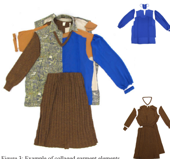
Figure 3: Example of collaged garment elements

As an introduction to this part of the workshop we will discuss the concept of the wardrobe. In addition to its very personal meaning and relevance the collected contents of a wardrobe also reflects the diversity of the fashion industry. It brings together different brands and types of clothing as well as the social and cultural codes and multitude of nuanced values these represent. The owner of a wardrobe is constantly monitoring and adjusting the content of this collection and curating its display with the choice of each outfit. It is in the creativity and authenticity of these acts of curating and wearing that great potential can be found. The aim of the workshop is to strengthen the role of the wearer as an active participant in the 'design' process and the creation of meaning and value in fashion.