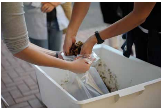
Figure 3: Workshop 2012