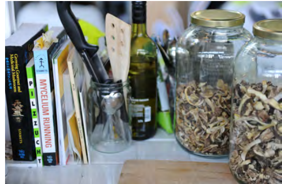
Figure 4: Workshop 2012