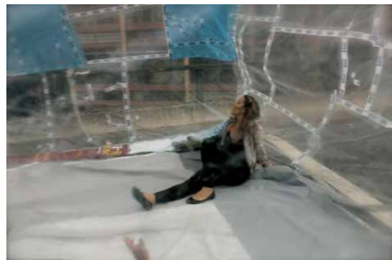
9. Aesthetic performance: The temporary space transforms Minhocao into a temporary space of enjoyment and bodily sensation of the city. Even though the design did not change the physical space of Sao Paulo, it mentally changed the social practices and the conception of Sao Paulo for the visiting guests. In that sense, Bolha Imobiliaria has impact as communication of other values in the city. It shows that it is possible to use public space differently at the same time breaking with the image of down town Sao Paulo as a dangerous and inhabitable space (see illustration 1).