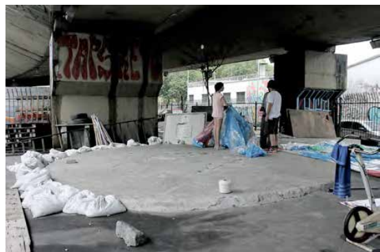
3. Assemblage Construction of the Bolha Imobiliária took place by reassembling the existing materiality of the city. The city fabric and the waste form the urban consumers is reused in the temporary structure. In that sense, the design reshape urban materiality. The processes constructed a social temporary space of non-commercial collaboration in a city governed by economical growth and interests.