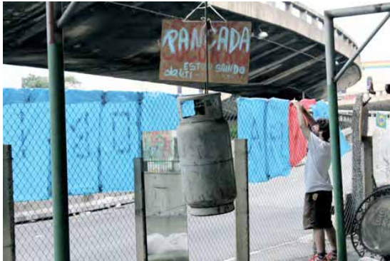
4. Assemblage and act: Design process as an act of reassembling the city: By choosing the reuse station and boxing academy Coletivo Glicerio under another highway in Sao Paulos slum, the designers choose to act with, within and by use of existing urban assemblages.