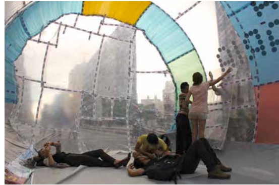
7. Design acts in public with the help from the public: Bolha Imobiliaria rises on Minhocao: It proposes alternative spaces for alternative uses and aesthetical sensations in a city of brutal functionality and growth.