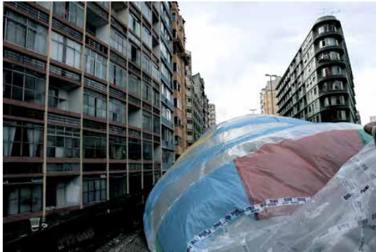
6. The temporary design acts in existing urban assemblages. Bolha Imobiliaria rises at Minhocao as an alternative and temporary bubble commenting on gentrification processes in downtown Sao Paulo.