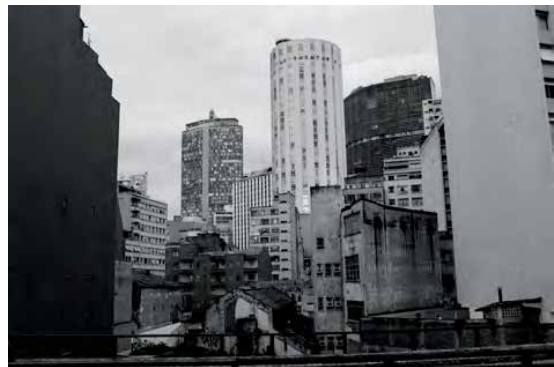
1. urban assemblages in downtown Sao Paulo: The socio-material assemblage of downtown Sao Paulo consists of a mixture high-rise buildings from the modernist area in the sixties and old abandoned and decaying houses. Furthermore, downtown is the home for many drug addicts living in the streets and gathering in the area Crackolandia near the old railway station. While the middleclass has moved outside of the city centre and now hides in high-rise condominiums with surveillance cameras, the drug addicts and homeless hang out in the streets. Sao Paulo's urban space are thus highly segregated. Thus, compared to many other cities, there is no sense of public space in Sao Paulo.

Thus the design practice of Muda_Coletivo can be understood as a design act assembling resources from the complex socio-material layout of the city.