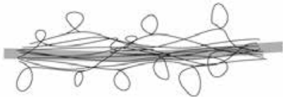
Figure 1: Design process-flow diagram.

design, through an expansion which takes place in more than one direction at a time. These deviations to the official storyline, contribute to a level of ambiguity and uncertainty, which designers must often cope with throughout a project's development. Nevertheless, it is through such side exercises or accidents that meaning is created, essentially informing the design process (see Figures 1 and 2).