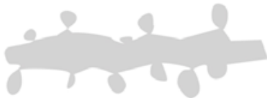
Figure 2: Deviations or accidents inform the design process.