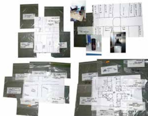
Figure 5: The sensory interviews revealed how the clinic is perceived by the patients, based on experience of each space.

where the patients spend most of their time throughout the day, proved to be one of the most anxiously perceived spaces, identified as excessively noisy and chaotic.