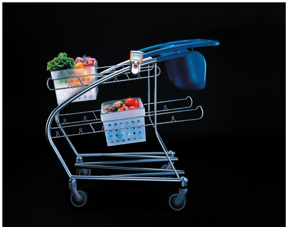
Figure 2. A prototype for a new shopping cart designed by IDEO. The new shopping cart concept considered issues such as maneuverability, shopping behavior, child safety and cost of maintenance. It has removable plastic baskets to increase shopper flexibility and to minimize theft. The prototype was designed in five days by a multidisciplinary team through brainstorming, research, prototyping, and gathering user feedback.

The ideas and observations were presented and representations were put on the wall. Thereafter the group generated twice