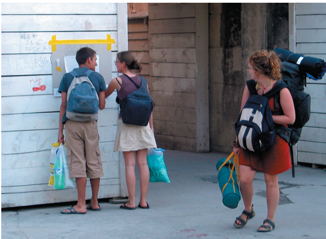
Figure 3. One of the prototypes for the e-board being tested by tourists in the city of Split.

Another, perhaps more interesting, aim is to show that ‘the design space model’ actually worked to guide and inform the actual work done in the Convivio summer school workshop. I.e. that the model can be used to design design processes.