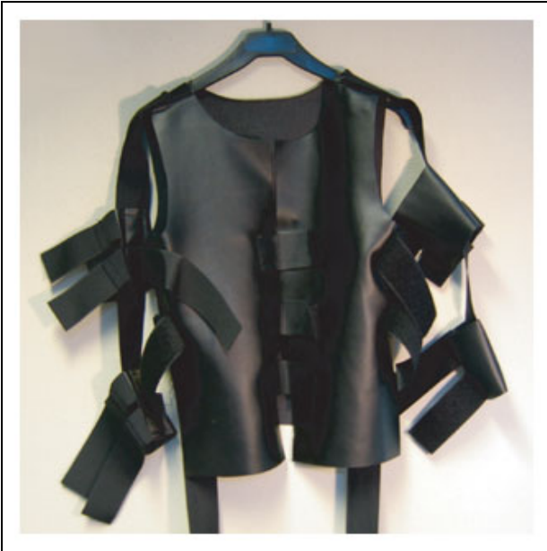
Figure 2: The Suit of the Involuntary Dance Machine

After the show there will be a limited opportunity for the audience to experience electric impulses provided by the Shock Boxes.