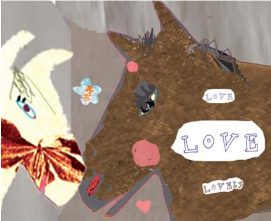
Figure 6: Love, lovely

Using visual clues to help readers make sense of the narrative— hearts, flowers and colour associated with love and lovely. Combining signs, symbols and lettering helps to communicate aspects of the story.