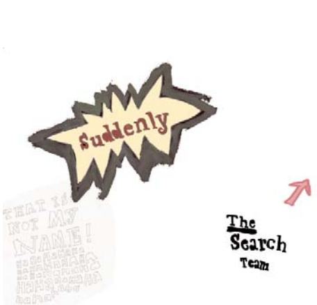
Figure 10: Suddenly text

Beginning to integrate letterforms and imagery in double page layout.