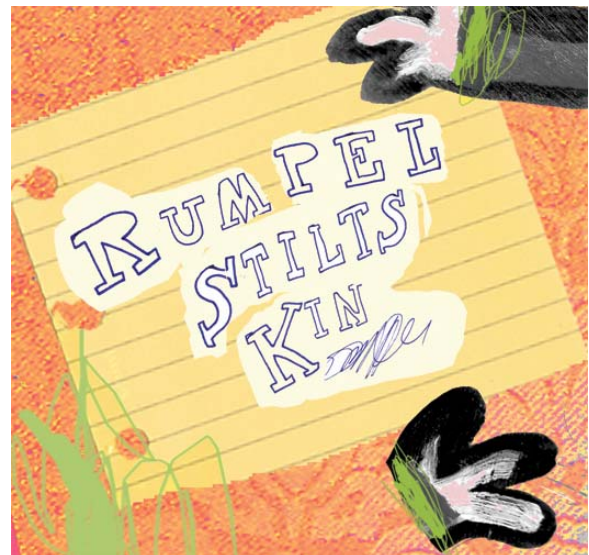
Figure 4: Rumpelstiltskin In this example I have used segmentation to encourage learners to distinguish parts of a new word or name.

In this project it is important that the lettering is legible and aids children's comprehension [18]. Visual clues used in the work need to excite readers and motivate them to decipher the text.