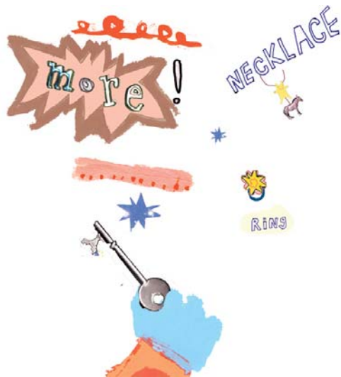
Figure 7: More!

I use scratched, scrawled, wobbly, naïve images and letterforms to aid comprehension throughout the book.