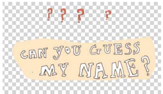
Figure 3: Guess? Asking questions throughout the narrative attempts to engage children in what is going on in an interactive way.