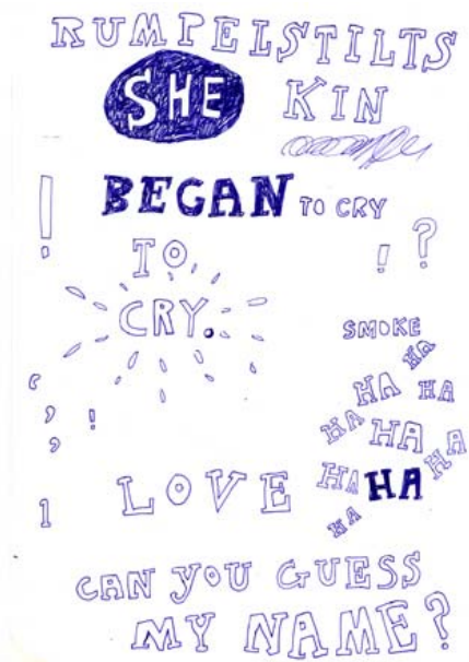
Figure 1: Sketchbook rough Biro lettering.

I am currently experimenting with lettering which is functional, visually appealing and fully integrated with the book's imagery [1].