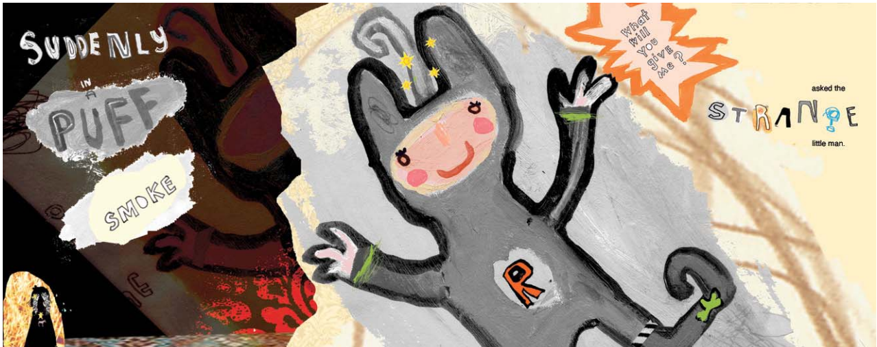
Figure 9: Rumpelstiltskin appears

Beginning to integrate letterforms and imagery in double page layout.