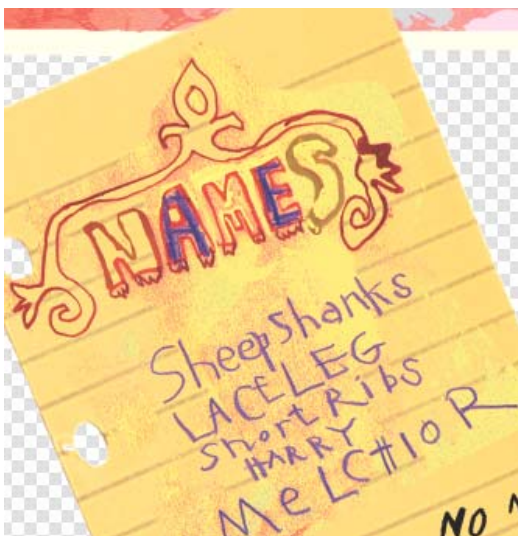
Figure 2: List of names The yellow background represents paper given to the Queen, with a list of names gathered by the animals. The letters should be legible but integrated into imagery.