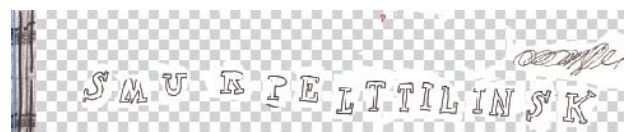
Figure 5: Cryptogram Jumbled letters of name. Readers are prompted to decode/decipher words.

In this project it is important that the lettering is legible and aids children's comprehension [18]. Visual clues used in the work need to excite readers and motivate them to decipher the text.