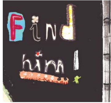
Figure 8: Find text

Combining of a range of letterforms, symbols and imagery as new words and concepts are introduced helps build learners confidence.