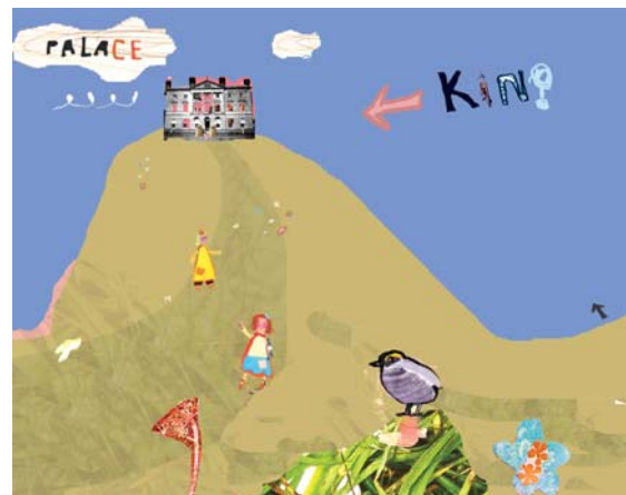
Figure 12: King and palace

Using arrow symbol, underline and outline to highlight specific words.