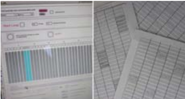
Figure 4 Left: The graphical interface of the software on computer screen. Right: picture of the “note sheets” to visualize the progress of the heating.

complexity in the design process. For example, in the case of designing the temporal pattern of the dynamic pattern we used with success a combination of a “note sheet” and a graphical interface to gain an overview of the sequence of the changes (see Figure 4). In other cases, however, we are still at a loss for how to cope with the complexity in a useful way. For example, putting together the color palette for one of the patterns, which in it self was a collection of patterns, proved to be incomprehensible (see Figure 5). At first we thought it was a matter of merely composing the two possible color states so they all would fit a coherent expression. We soon realized, however, that the actual transition between two states also contained a range of colors resulting in combinatorial possibilities that at present is difficult if not impossible to sketch. Obviously, this experiment will lead to new experiments where we will try different strategies and hopefully be able to develop new tools.