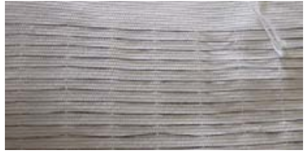
Figure 1 Sample of woven cotton with conductive threads on one side. The threads can serve as heating elements and thus change the color of a thermo chromatic pattern printed on the other side.

This project will run along side the other projects and gradually expand in size and complexity.