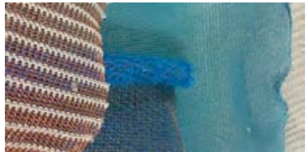
Figure 3 Three samples of textiles knitted with different strength of conductivity. Left: knitted copper with viscose. Center: knitted blue mohair with brass. Right: knitted turquoise cotton with stainless steel.