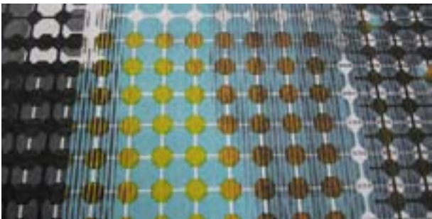
Figure 5 An example of the range of colors expressed in the transition between two color states.